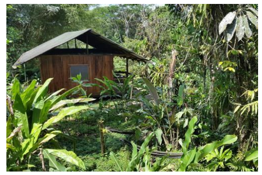
Day 1: Arrival – Journey to the Amazon Rainforest – Leisure or optional activities (D)

Within 3 hours from Quito you will arrive in our exclusive Lodge. During your drive you will notice how the vegetation changes from the landscape of the Andes into the rainforest. After passing the gate to the Amazon Rainforest you will be in a mountain jungle paradise – Hakuna Matata is your private hideaway in the tropical forest. During your trip you came closer to sea level by about 7,200 feet and are located on about 2,000 feet now.