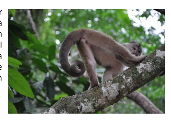
Day 3: Rafting Tour through the Jungle (B/L/D)

About 1.5 hours later you will be back in your canoe to get to the car which drives you to the little town Misahualli where you will eat a typical "almuerzo" – lunch – before you can take a walk to the beach to be greeted by many capuchin monkeys. At around 3 pm you will be back at the Lodge to take pleasure in relaxing at the pool or in a hammock with a cocktail or keep on exploring the area. In the evening another 3 course meal is waiting for you which you can enjoy in the special atmosphere of the jungle.