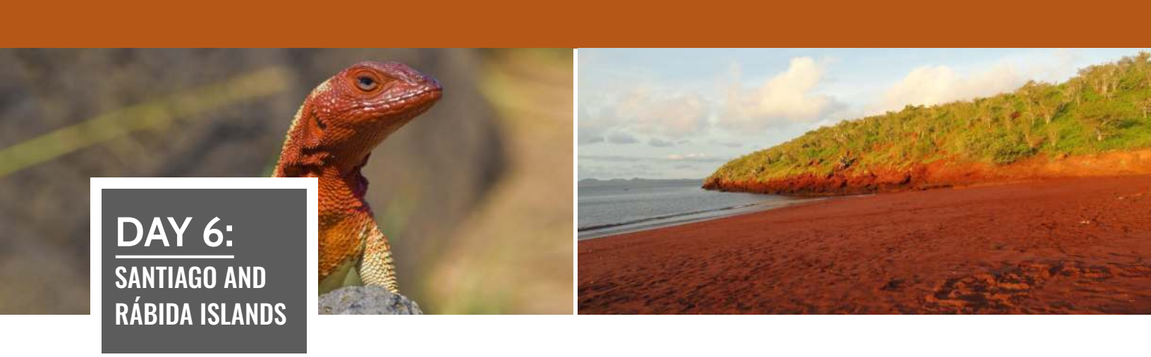
AM - Puerto Egas, Santiago island

Puerto Egas is a beach located on the west side of Santiago Island. Volcanic tuff deposits have favoured the formation of this special black sand beach. The site is called Puerto Egas because at the beginning of the previous century, there was an attempt by a man named Hector Egas to extract the salt of the lagoons. The enterprise failed but it left traces of the infrastructure amidst the island's wilderness.