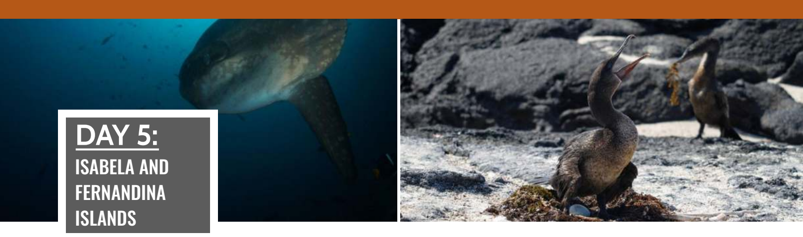
AM - Punta Espinoza, Fernandina island

After breakfast you will disembark to Fernandina, the Galapagos' westernmost and youngest island (less than one million years old).