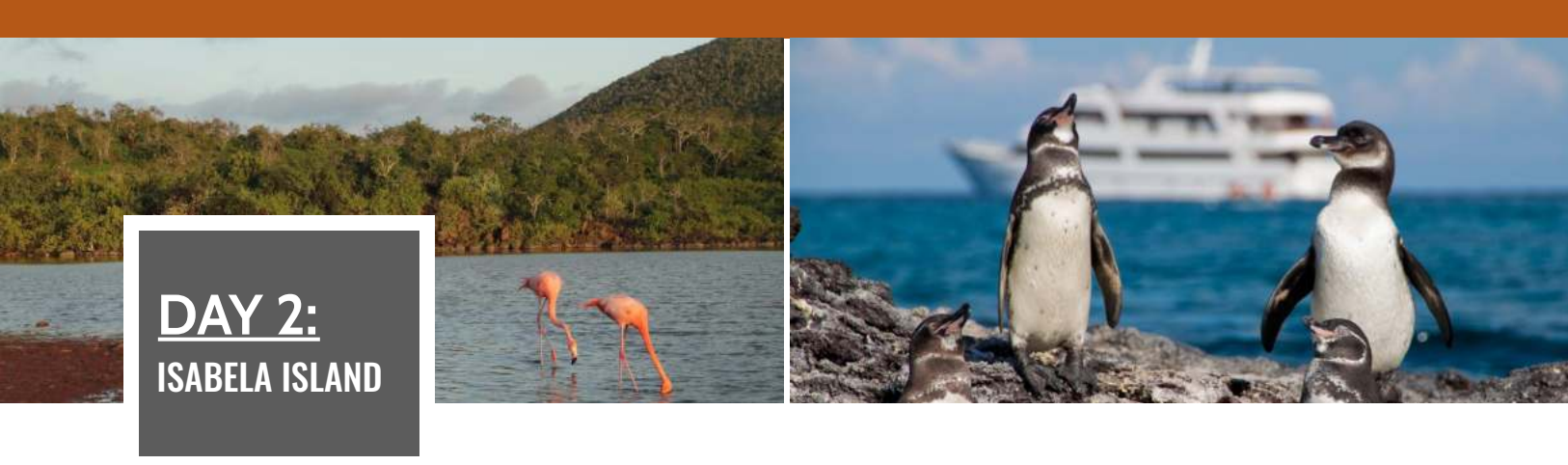
AM - Punta Moreno, Isabela island

During the night we navigated to the northwest coast of Isabela, where two huge volcanoes are found, the Sierra Negra and the Cerro Azul. In between these two is located our visit point, Punta Moreno.