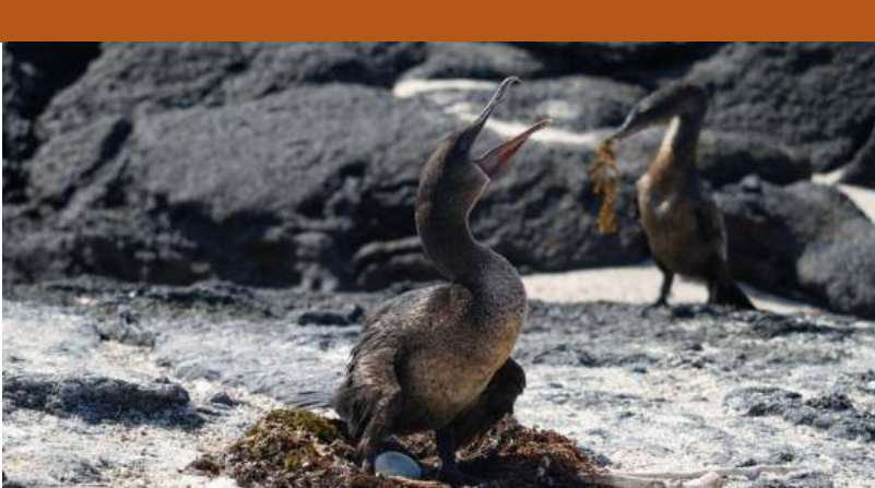
AM - Punta Espinoza, Fernandina island

After breakfast you will disembark to Fernandina, the Galapagos' westernmost and youngest island (less than one million years old).