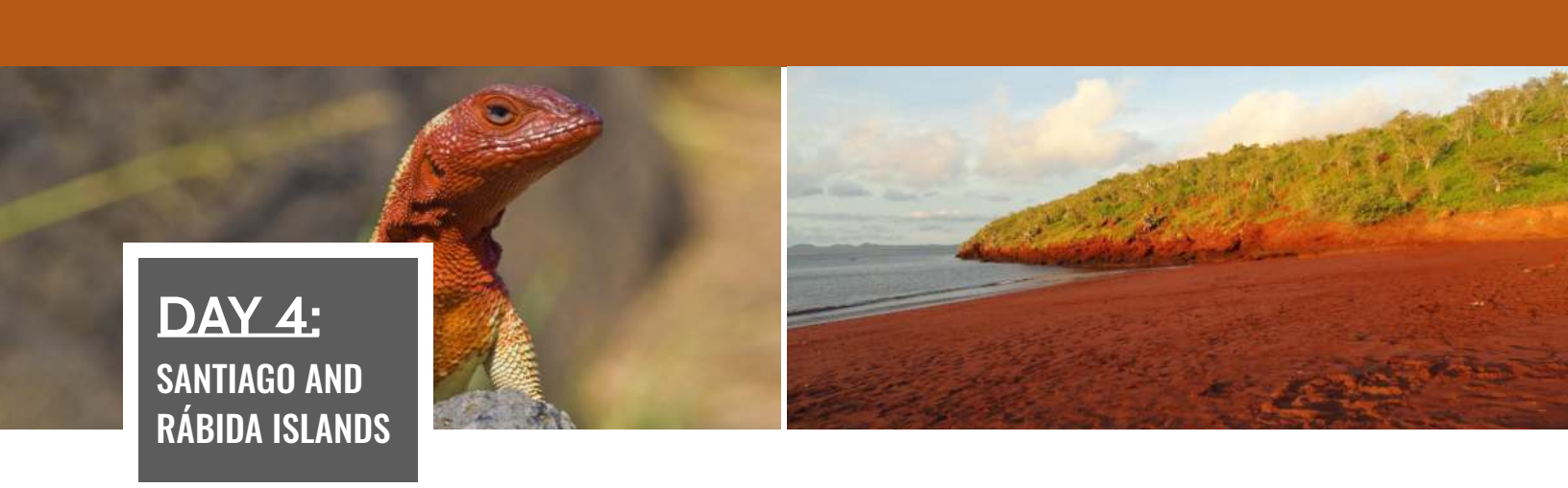
AM - Puerto Egas, Santiago island

We will disembark to the Puerto Egas, where you will enjoy a very unique guided walk along its coastline, masterly sculptured with black basalts and polished multi-coloured ash-layers. All this scenery forms a photogenic location with collapsed lava tunnels, natural arches, caves and blowholes known as 'Darwin's toilet'.